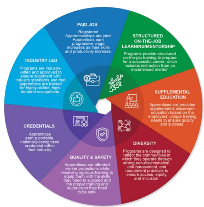
Figure 1: The Seven Elements of a Registered Apprenticeship Program

Registered Apprenticeships (RAPs) and pre-apprenticeships (Pre-RAPs) are an excellent alternative pathway to employment. They pair classroom instruction with on-the-job training so apprentices can earn money while they learn (See Figure 1). The completion of a RAP yields a highly employable credential and can land someone an excellent job in a stable field; 91% of apprentices are employed full time upon completion.<sup>3</sup> For those who do not meet entry requirements for a RAP such as those without GEDs or those under the age of 18, Pre-RAPs can put a young person on the path to